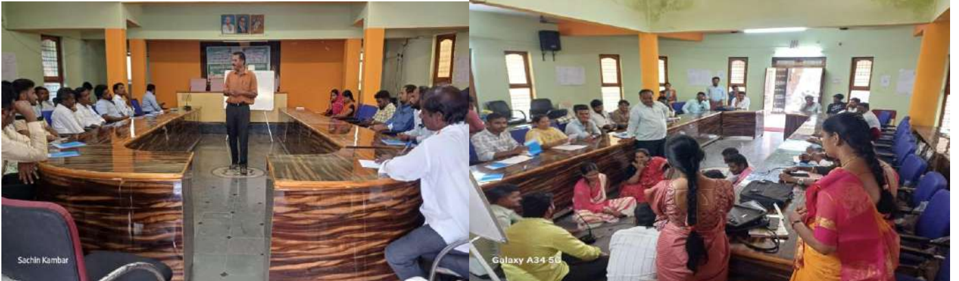
Kalaburgi Edition Feb 14, 2025 Page No. 19 Powered by: erelego.com