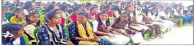
ಸಂಚಾರಿಗಳ ಗುರುಭವನದಲ್ಲಿ ನಡೆದ ಸಮಾರಂಭದಲ್ಲಿ ಭಾಗಿಯಾಗಿದ್ದ ವಿಧ್ಯಾರ್ಥಿ ಸಮೂಹ. ಮಾಡಲು ಎಲ್ಲ ಲಾಭಿಗಳ ಸಹಕಾರ ಆಗುತ್ತವೆ ಎಂದರು.