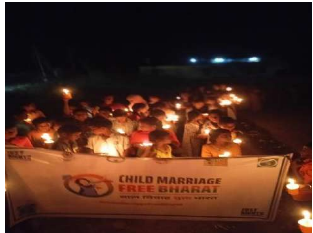
Group Pledge Kumnoor Village Wadagera Taluka