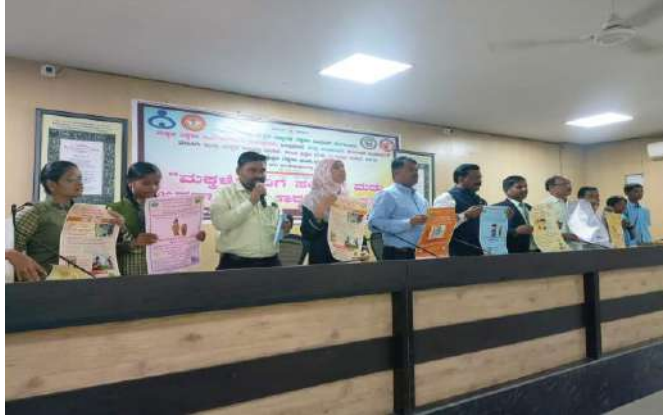
Child Marriage & Child Line 1098 Poster Inauguration

ಮಕ್ಕಳು ಸ್ವಯಂಚಾಲಿತವಾಗಿ ನಿಷೇಧಿಸುವುದು. ಮಕ್ಕಳ ವಿವಾಹವನ್ನು ಸ್ವಯಂಚಾಲಿತವಾಗಿ ನಿಷೇಧಿಸುವುದು. ಮಕ್ಕಳ ವಿವಾಹವನ್ನು ಸ್ವಯಂಚಾಲಿತವಾಗಿ ನಿಷೇಧಿಸುವುದು.