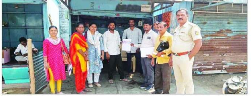
ವಡಗೇರಾದಲ್ಲಿ ಪುನರ್ವಸತಿ ಅಭಿಯಾನ- ಬಾಲಕಾರ್ಮಿಕ ಪದ್ಧತಿ ನಿರ್ಮೂಲನೆಗೆ ಒಂದು ಹೆಜ್ಜೆ ಕಾರ್ಯಕ್ರಮದ ಪೂರ್ವಭಾವಿ ಸಭೆ, ಕಾರ್ಯಪಡೆ ಸಮಿತಿ ಸಭೆ ಜರುಗಿತು.

ಸಭೆಯ ನಂತರ ನಗರದ ವಾಲ್ಮೀಕಿ ವೃತ್ತದಿಂದ ಕುರಕುಂದ ರಸ್ತೆಯಲ್ಲಿರುವ ಅಂಗಡಿ ಮತ್ತು ವಾಣಿಜ್ಯ ಸಂಸ್ಥೆಗಳು, ಗ್ಯಾರೇಜ್‌ಗಳು ಮತ್ತು ಹೋಟೆಲ್‌ಗಳಲ್ಲಿ ಹಠಾತ್ ದಾಳಿ, ತಪಾಸಣೆ ನಡೆಸಿ ಒಂದು ಕಿಶೋರ