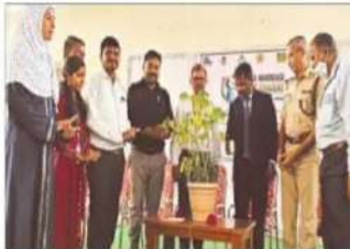
ಯಾದಗಿರಿ: ನಗರದ ಸರ್ಕಾರ ಪ್ರಥಮ ದರ್ಜೆ ಕಾಲೇಜು ಆರೋಗ್ಯಾಲಯಂ ಡಾಲ್ ನಲ್ಲಿ ಬಾಲ್ಯ ವಿವಾಹ ಮುಕ್ತ ಭಾರತ ಅಭಿಯಾನ ಮತ್ತು ಕೆಲ ಪ್ರಸಾರ ಕಾರ್ಯಕ್ರಮವನ್ನು ಗಣ್ಯರು ಉದ್ಘಾಟಿಸಿದರು.

■ ಉರಿಯವಾಣಿ ಸಮಾಜ ಯಾದಗಿರಿ: ಉತ್ತಮ ಸಮಾಜ ನಿರ್ಮಾಣಕ್ಕೆ ಕನಡಾಪುರ, ಬಾಲ್ಯ ವಿವಾಹ ಅಡ್ಡಿಯಾಗಿದೆ ಎಂದು ಸಿವಿಲ್ ಸ್ವಾಯತ್ತೀಕರಣ ಮಂತ್ರಿಯವರ ಹೇಳಿಕೆಯು. ಜಿಲ್ಲಾ ಶಾಸನಸಭ ಸದಸ್ಯಗಳ ಪ್ರಾಧಿಕಾರ, ಮಹಿಳಾ ಮತ್ತು ಮಕ್ಕಳ ಅಭಿವೃದ್ಧಿ ಇಲಾಖೆ ಮತ್ತು ಯುವ ಸಂಗಠನ ಸರ್ಕಾರ ಪ್ರಥಮ ದರ್ಜೆ ಕಾಲೇಜು ಆರೋಗ್ಯಾಲಯಂ ಡಾಲ್ ನಲ್ಲಿ ನಡೆದ ಬಾಲ್ಯ ವಿವಾಹ ಮುಕ್ತ ಭಾರತ ಅಭಿಯಾನ ಮತ್ತು ಕೆಲ ಪ್ರಸಾರ ಕಾರ್ಯಕ್ರಮವನ್ನು ಉದ್ಘಾಟಿಸಿ, ಮಾತನಾಡಿದರು.