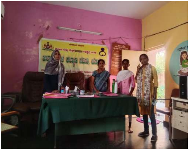
Child Labor Raid and Task Force Committee Meeting,